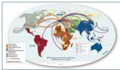
Global connectivity map